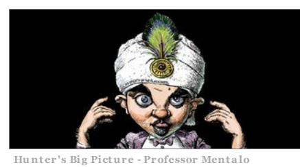
Hunter's Big Picture - Professor Mentalo